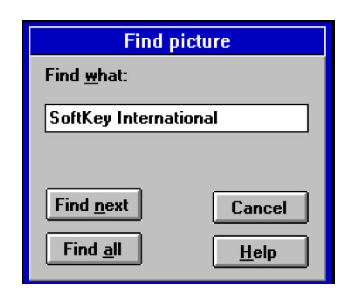
The Find Picture Dialog Box